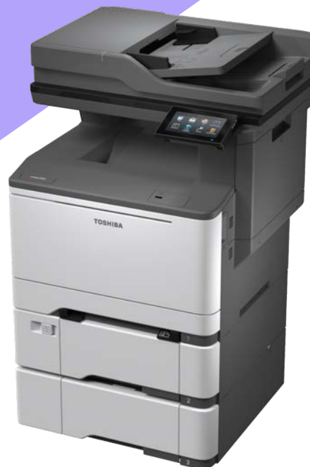
e-Studio 339cs - 3 Cassettes