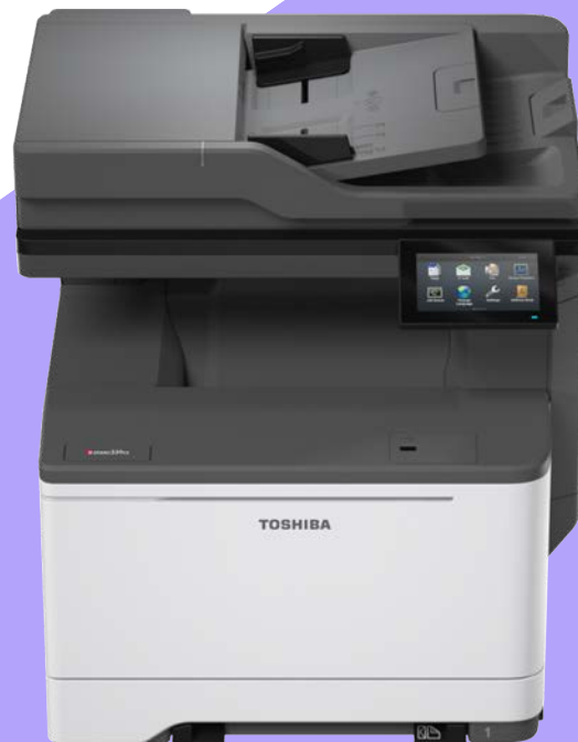
e-Studio 339cs - 1 Cassette (Standard Build)

As with all Toshiba devices, the quality of both the monochrome and colour output is impeccable. Images and text are reproduced in striking clarity, down to the smallest details, delivering professional-quality results to enable businesses to print more material in-house.