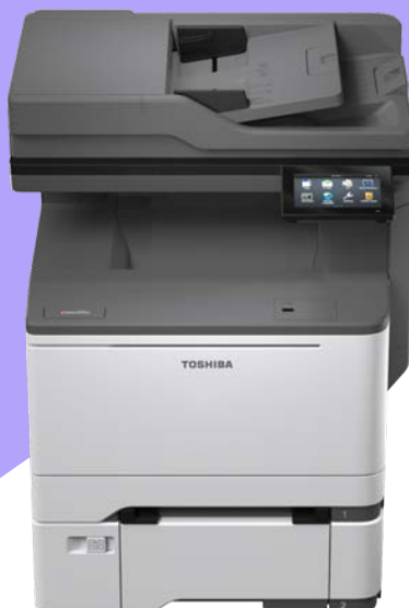
e-Studio 339cs - 2 Cassettes