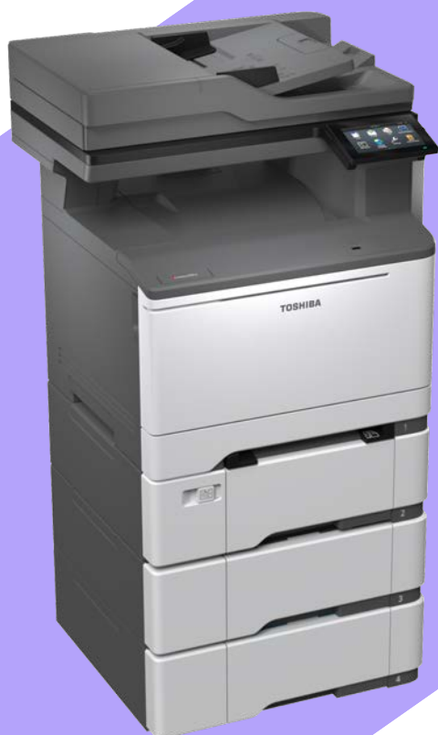
e-Studio 339cs - 4 Cassettes