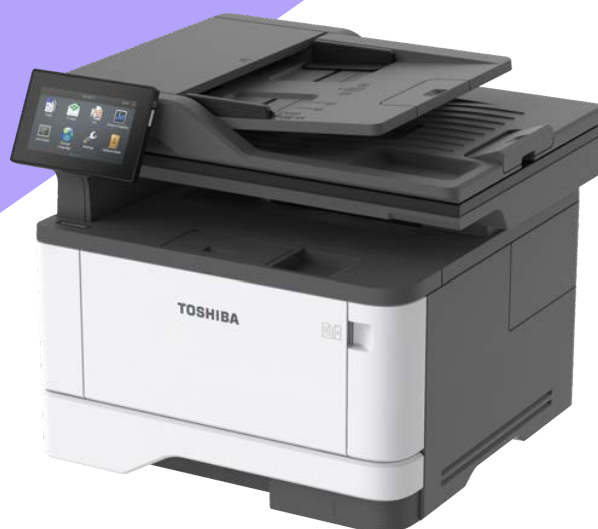
e-Studio 409as - 1 Cassette (Standard Build)