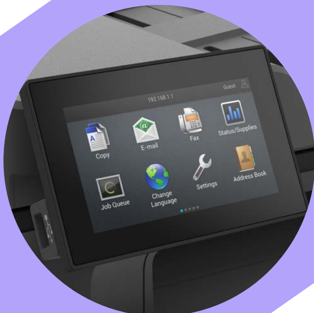
Intuitive 4.3" Touch Panel