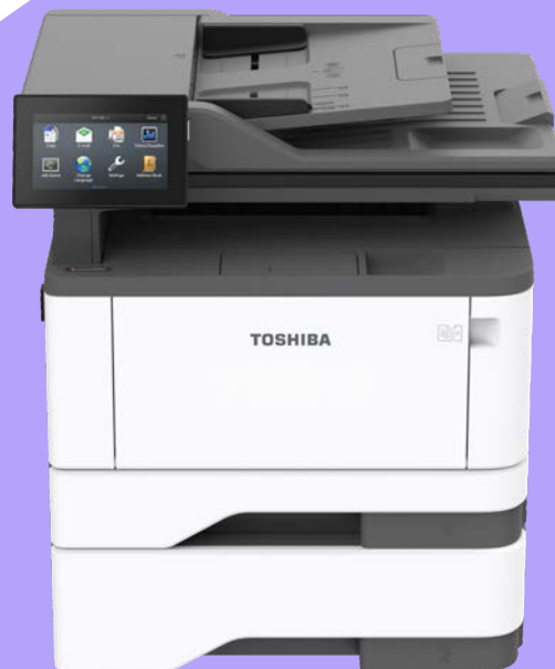
e-Studio 409as - 2 Cassettes

The e-STUDIO409as is equipped with an additional layer of security, Trusted Platform Module 2.0 (TPM 2.0). The TPM 2.0 has self-encrypting drives which offer comprehensive, hardware-level security against third party access, encrypting data with a unique encrypted key to help ensure that none of it falls into the wrong hands. TPM not only provides peace of mind by ensuring an extraordinarily high-level of data security within your organisation, but also enables you to comply with the stringent data security requirements of many corporations and government agencies.